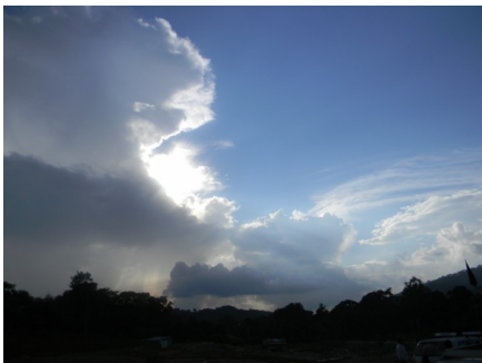
Art in the Sky: A Panoramic View from TAB-Shahpur, CUHP