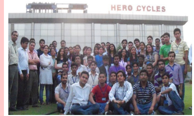
Visit to Hero Cycles

The students acquainted themselves with the different operations at the shop floor level like welding, brimming and freezing and the way in which the production process takes place. The objective behind the visit was to acquire